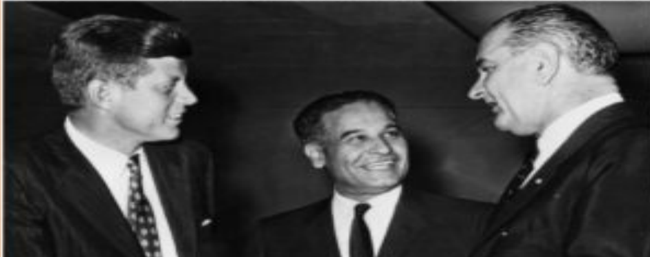
Dalip Singh Saund, the first ever Asian American congressman – he was of Sikh heritage and was elected in 1957.