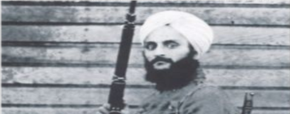
Bhagat Singh Thind Supreme Court Case: United States v. Bhagat Singh Thind