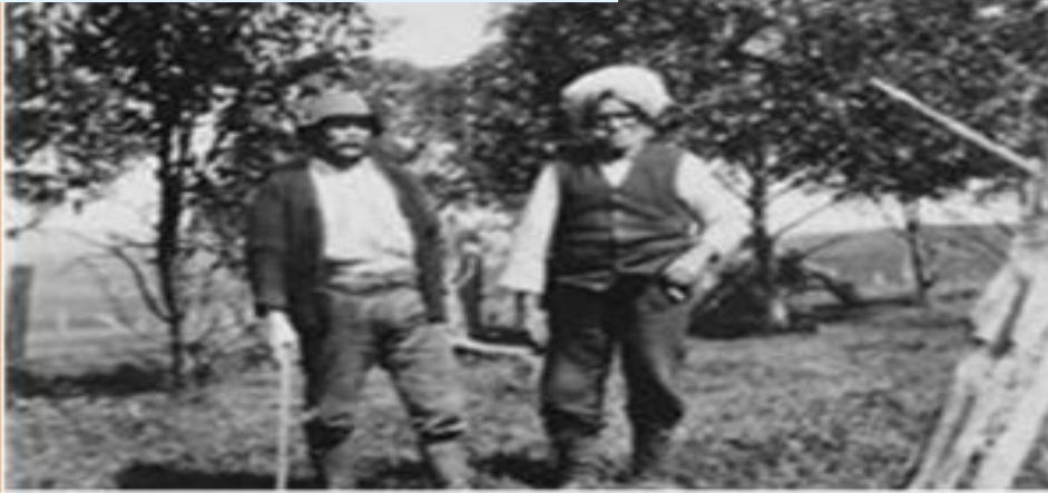
Farmers on the West Coast