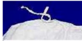
Underpants (Kachera) Self Discipline