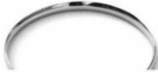
Iron Bracelet (Kara) Good Deeds