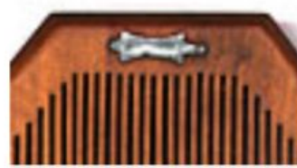
Comb (Kanga) Cleanliness